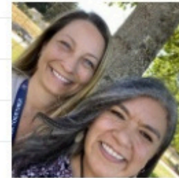
Your Admin Team We are proud to serve the Madison Community!